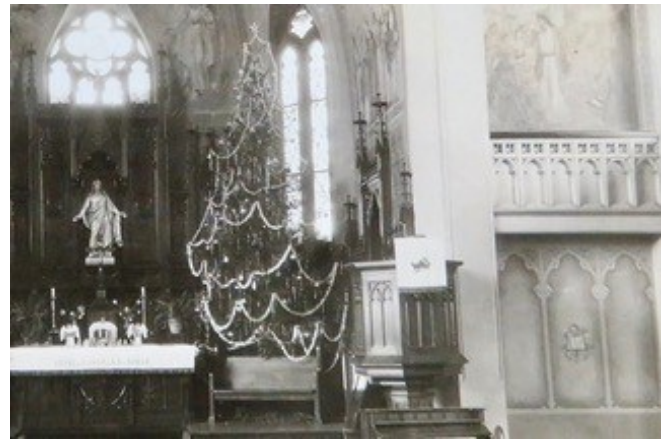
Picture of Sanctuary from 1925 with the angel at the bottom right.