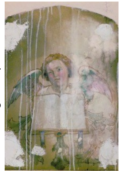
Close-up; picture of damaged, uncovered angel after plaque removed, 2015